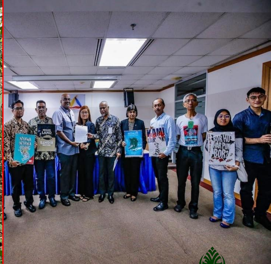
Protesting against degazettement of permanent reserve forest status and land reclamation projects